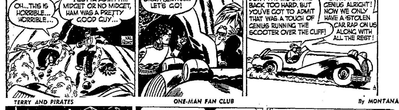
TERRY AND PIRATES