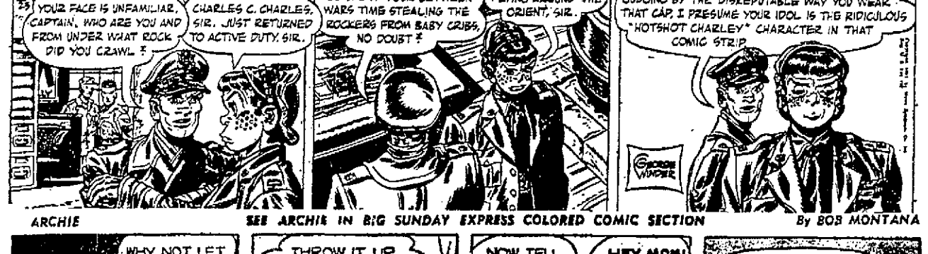
ONE-MAN FAN CLUB