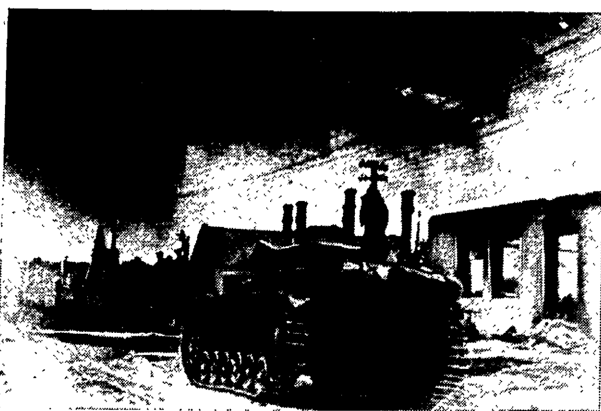
Leadens skies, dark warning of the Russian winter now beginning, are fateful backdrop for German tank rumbling through the snow-sprinkled streets of Vyazma, on the road to Moscow. Note shells of buildings, left in ruins by retreating Russians. Picture was radioed from Berlin.