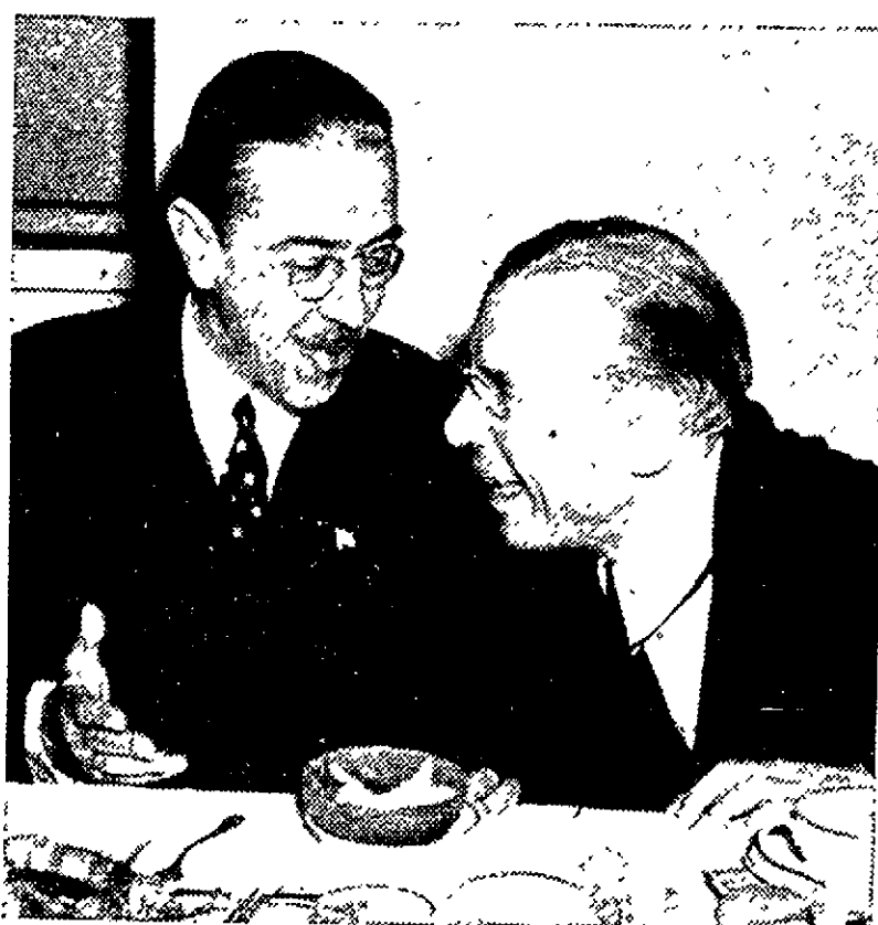
Senator Don Nicolson Costa Mendez of the Argentine chamber of deputies passes on some South American good humor to good neighbor Rep. Sol Bloom, chairman of House Foreign Affairs Committee, at luncheon honoring visiting Argentines in Washington.