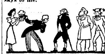
Assault on Bunker Hill

Incidentally, some people who never get within a masher shot of the K. and Q. will make your hair stand up now with the bright things "I says to the king and he says to me."