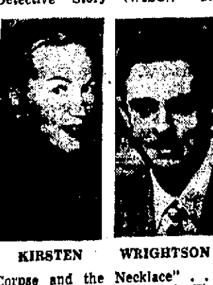
Corpse and the Greatest Story Doeth Truth."

the Necklace" . . . ry (WENR): "He That Doeth 6:30 p. m. — Gabby Hayes WISC): atory of Uncle Billy