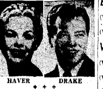
HAVER + + + DRAKE

10 a.m.—Destination Freedom (WMAQ): story of Katherine Dunham. 11:30 a.m.—Eternal Light (WMAQ): "On Wings of Eagles," story of air-migration of 45,000 to Israel. 1 p.m.—NBC Theater (WMAQ): "A Portrait of the Artist as a Young Man," by James Joyce. 1:30 p.m.—You Are There (WBBM): "The Battle of Thermopylae." 2 p.m.—One Man's Family (WIBA): 18th anniversary. 3:30 p.m.—Proudly We Hall (WFOV): John Payne in "Jimmy's Birthday." 4:30 p.m.—Greatest Story (WISC): "A Cup of Water." 5 p.m.—My Favorite Husband (WBBM): Friendship Week takes a beating. 5:30 p.m.—Our Miss Brooks (WBBM): tape-recording idea hits a snag. 7 p.m.—Sam Spade (WIBA): seeks killer in hobo jungle. 7:30 p.m.—Theater Guild (WIBA): Mickey Rooney, Eggy Ann Garner in "National Velvet." 9:30 p.m.—Crime Does Not Pay (WGN): J. Edward Bromberg in "Ruin Runner."