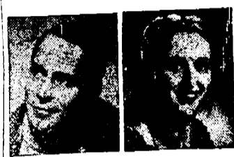
TONE * * * HOLM

6:30 p.m. — Amazing Mr. Malone (WISC): Gene Raymond in story of payroll robbery linked with murder.