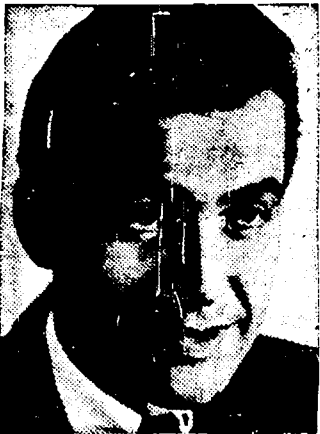
JAMES STEWART ON WIBA at 8 P. M.