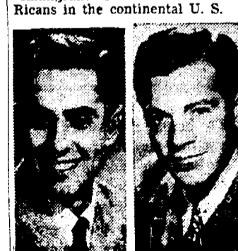
Power * * * Andrews

3 p. m. — Living 1949 (WIBA): "Immigrant Citizens" — Puerto Ricans in the continental U. S.