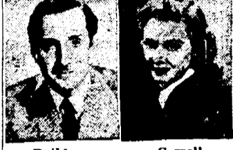
Rathbone * * * Carroll

6 p. m. — National Vespers (WENR): "Learning the Joy of Living."