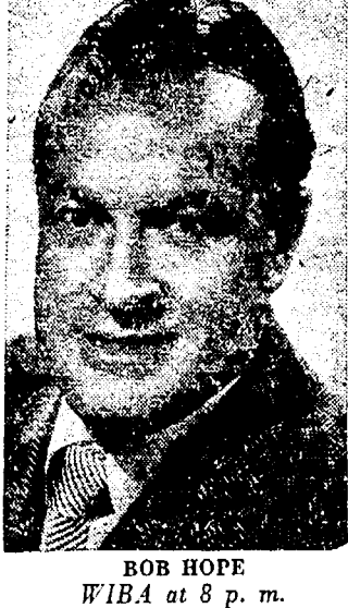
BOB HOPE WIBA at 8 p. m.