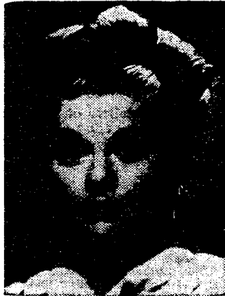
LUCILLE BALL WIBA at 8 p. m.