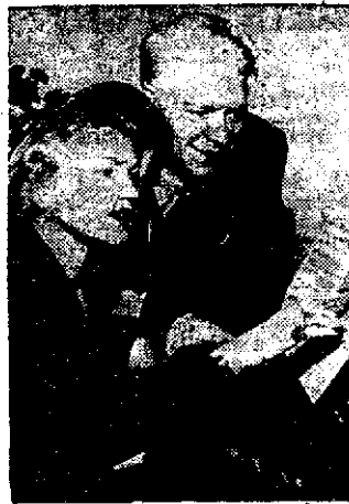
DOROTHY KIRSTEN AND NELSON EDDY WIBA at 8 p. m.