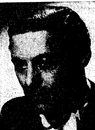
REX HARRISON WIBA at 7