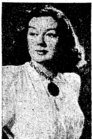
ROSALIND RUSSELL WBBM at 8