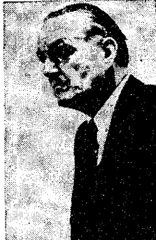
REP. FRANK B. KEEFE WISC at 7:45