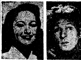
LAMOUR KAYE WBBM at 3 p. m.