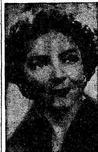
HELEN HAYES WBBM at 8