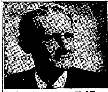
Shirt Shop Manager Glad He Switched to Calvert 8 Years Ago