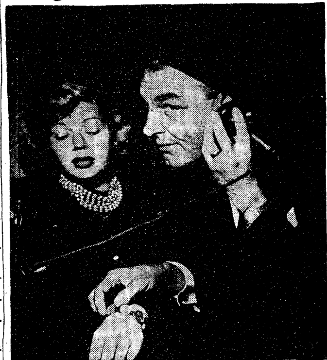
Florence "Miss Duffy" Halop has discovered an easy way to keep Ed "Archie" Gardner in nickles for those many phone calls he makes to her father, the mysterious and absent owner of NBC's "Duffy's Tavern." The secret is a newly invented coin bracelet which holds 10 nickles and is pretty besides.