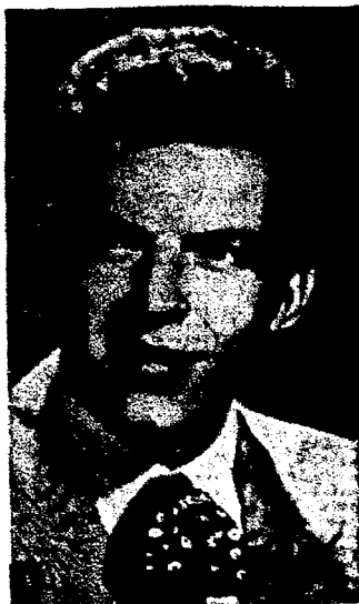
FRANK SINATRA WIBA at 8

10:30 a. m. — PTA Program (WHA): "Youth — Wisconsin's