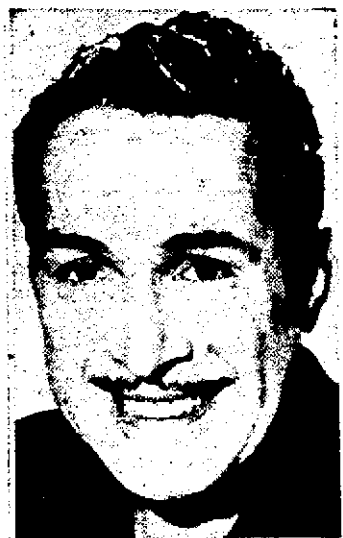
J. CARROLL NAIISH WBBM at 7:30