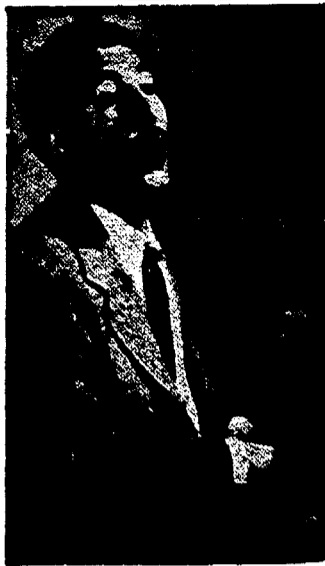
HAL PEARY as "The Great Gildersleeve" WMAQ at 6:30

2 p. m. — Listen to This (WLS): "Deed I Do," "A Tree in the Meadow," "Beyond the Blue Hor-