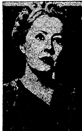
IRENE DUNNE WBBM at 7