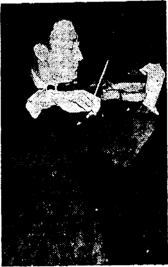
JASCHA HEIFETZ WIBA at 8