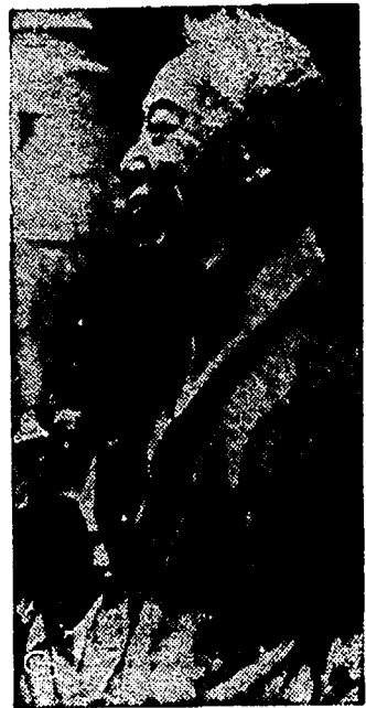
DR. SYNGMAN RHEE

Newly elected president of Korea and lifelong Korean patriot, Dr. Syngman Rhee delivers acceptance speech at inauguration ceremonies in front of the capitol in Seoul.