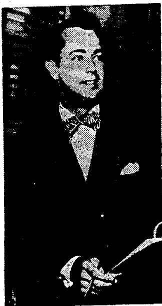
ALAN LADD WKOW at 9:30