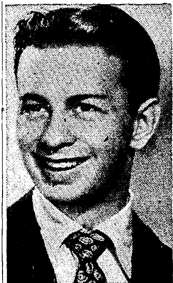
MEL TORME WIBA at 7

tries to replace it (on WIBA at 7) . . . Mystery Theater (WBBM): man suspects wife of plotting his death.