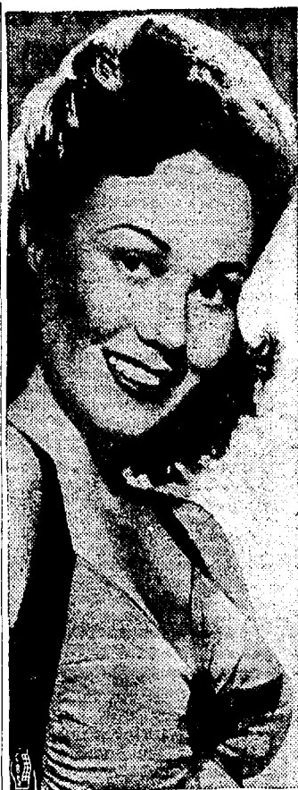
CONNIE HAINES WBBM at 7