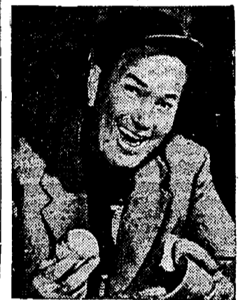
DIZZY DEAN WIBA at 4 Saturday