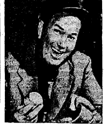
DIZZY DEAN WIBA at 4 Saturday

5:30 p. m. — Saturday Night Serenade (WBBM): at new time; "Summertime," "It's Magic," "Nature Boy," "You Belong to My Heart," "Auf Wiedersehen," "Whiffenpoof Song," "Little White Lies."