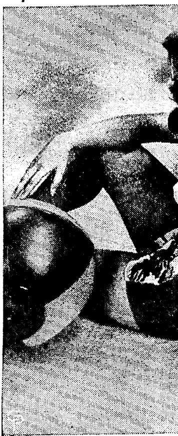
One hundred twenty-six po Anaconda, brown-eyed sophomore chosen "Miss Montana, 1948," h contest so she can continue studi