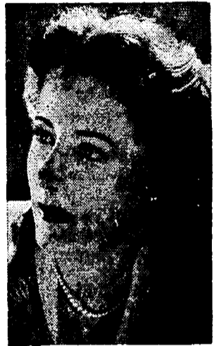
IRENE DUNNE WLS at 7:30

(WMAQ): Gregory Peck presents Wanda Hendrix in story of blind youth's faith (on WIBA at 5:30) . . . The Greatest Story (WENR): a slave teaches temper-control.