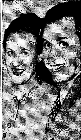
FIBBER MCGEE AND MOLLY WIBA at 10:30