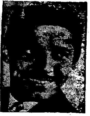
JEAN SABLON WIBA at 1; WBBM at 4:30

3:30 p. m.—School of the Air (WBBM): "The Rights of Man." 4:30 p. m. — Rehabilitation