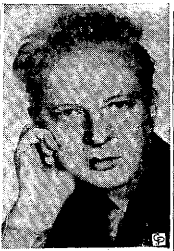
LEOPOLD STOKOWSKI WBBM at 2 p. m.