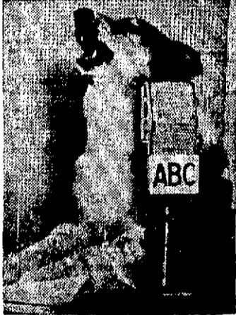
LASSIE WENR at 1 p. m.