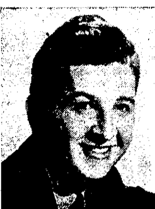
EDDIE BRACKEN WBBM at 8:30 p. m.