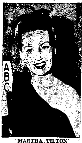
WENR at 5 p. m.

offers an interpretation of "La Boheme;" music, "We'll Gather Lilacs," "Flower Song" from "Car-men," "Make Believe," "Frasquita Serenade.