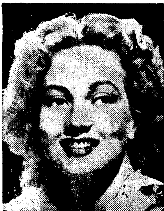
ANN SOTHERN WBBM at 7:30

8:30 p. m. — Starlight Serenade (WGN, WIBU) "Fine and Dandy," "Good, Good, Good," "The More I See You," Drigo's "Serenade," "Mujer Mexicana."