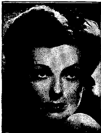
AGNES MOOREHEAD WBBM AT 8:30