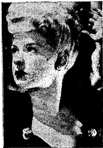
BETTY HUTTON WBBM at 9 p. m. Monday