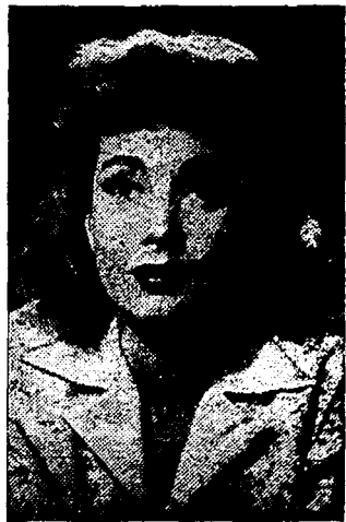
ANN SOTHERN WLS at 6

9:15 p. m. — Army Service Forces Presents (WCFL): Jay C. Flippen starred in "Dear Marge," story hailing special services division of army.