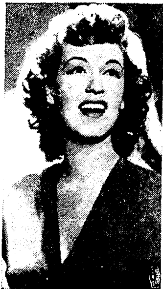
RISE STEVENS WBBM at 9:30

8:30 p. m. — Mr. District Attorney (WMAQ): directs a murder solution from his hospital bed.