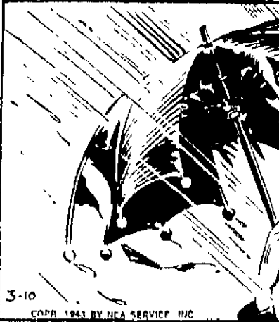
3-10

more interested in obtaining information than in giving it out arouses the interest of "Mr. District Attorney," whose investigation uncovers a Nazi spy nest, in "The Case of the Curious Crystal Gazer," on Wednesday at 9:30 p. m., EWT., on WEAF.