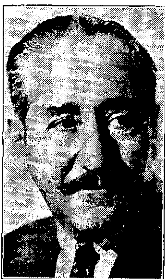
ADOLPHE MENJOU WIBA at 8