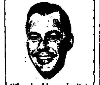
Why should you hesitate to wear a hearing aid if you need one?

Research reveals that the most frequent reason for not wearing a hearing aid is laziness! But hundreds of thousands of people know that a small ear-button doesn't change their appearance. They wear a hearing aid proudly and happily because they are an eager to put their friends at ease as they are to be at ease themselves. If your physician recommends an aid, and if you know the facts about hearing aids, you will wear a Zenith. You'll find other aids selling at two or three times as much, but you can't buy a better hearing aid than a Zenith at any price!