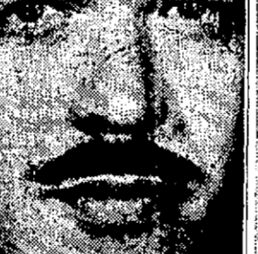
on your Radio

She begins her sixth year on CBS Radio Oct. 4 and her second on CBS-TV Oct. 2.