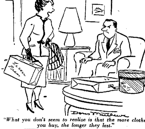
"What you don't seem to realize is that the more clothes you buy, the longer they last."