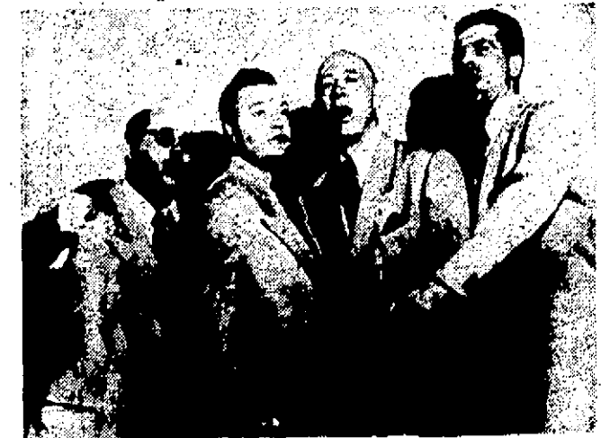
THE HAWKEYE FOUR

Among the outstanding quartets at the eighth annual "Harvest of Harmony" this weekend will be the Hawkeye Four of Des Moines, Ia. The show will begin simultaneously in East and West high school auditoriums at 8 p. m. Saturday.