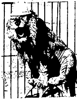
A KONYOT LION

AT THE CIRCUS: Circus-goers are used to seeing fierce lions, but funny ones are something else. This year's edition of "the greatest show on earth"—the Ringling Brothers and Barnum and Bailey Circus—has lions that are both ferocious and comic.