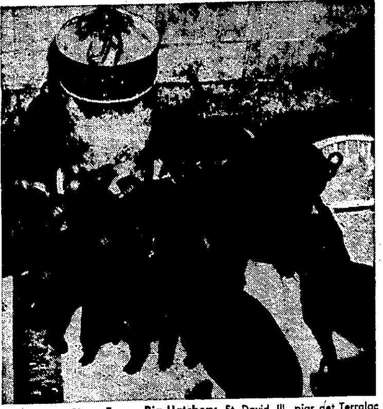
At the Little Sister Farms Pig Hatchery, St. David, Ill., pigs get Terralac in chicken water fountains. See photo above. Other Terralac feeders use homemade troughs of various kinds.

Send 220-pound hogs to market 4 to 5 weeks earlier