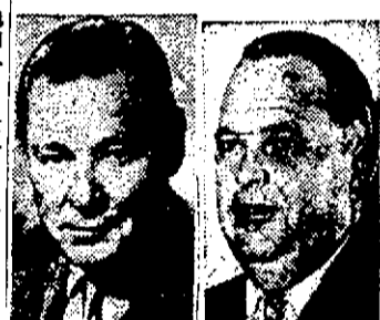
Drake university senior... Gabby Hayes (WISC): "Billy the Kid."

FM channels: WIBA-FM 101.5 M. WWCFF (WIBU) 94.9 M. WISC-FM 88.1 M.