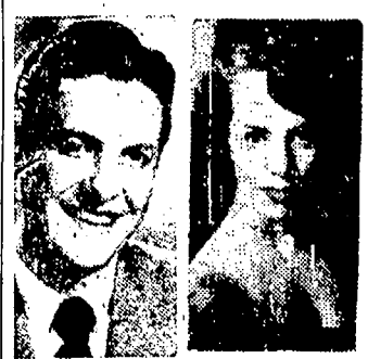
Robert Cummings Lisa Kirk