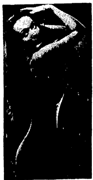
LUDMILLA TCHERINA Ludmilla Tcherina, Paris-born dancer who was prima ballerina in Serge Lifar's Monte Carlo ballet, will be seen as Julietta in "Tales of Hoffman," which opens today at the Parkway theater.